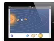
Student using the MimioStudio Collaborate feature.

Get the most from your mobile devices with truly collaborative learning.