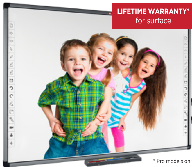
* Pro models only

Every board comes with Avtek Interactive Suite software.